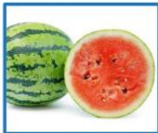
Watermelon w/ Seeds 980-6175 | 1/1 ct