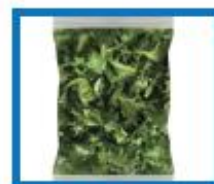
Trueharvest One Cut Crispy Leaf 980-6665 | 4/1.5 lb