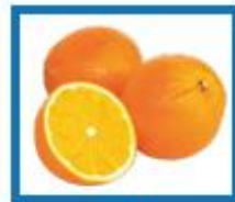
Oranges 980-5020 | 1/40 lb