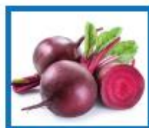
Beets, Red V/F 984-0020 | 5/5 lb