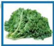
Lettuce, Kale Green 981-5275 | 1/6 ct 981-5267 | 4/6 ct