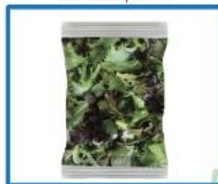
Trueharvest One Cut Truemix 980-6667 | 4/1.5 lb