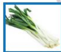
Leek, Fresh 06-8305 | 1/12 ct