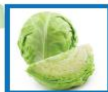
Cabbage, Green 06-8838 | 1/2 ct 980-0067 | 1/sack ea