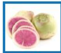
Watermelon Radish 985-8887 | 1/5 lb 981-2502 | 5/5 lb