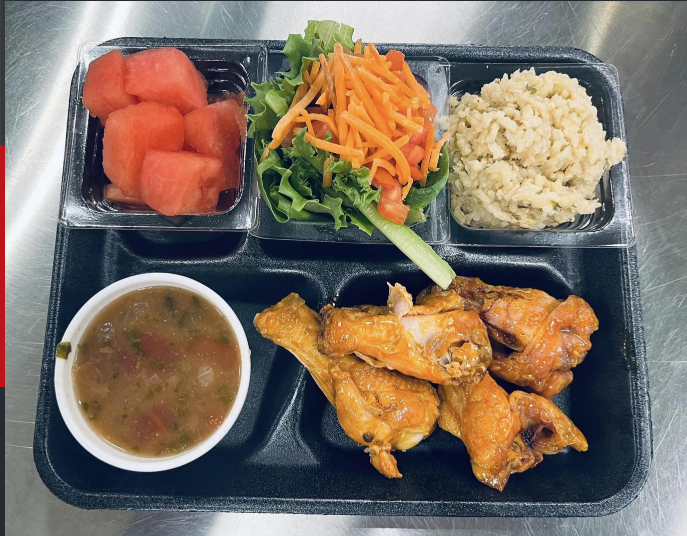
Manor ISD – Greener Pastures Chicken