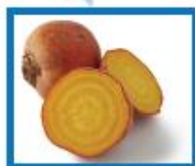
Beets, Gold V/F 985-8027 | 5/5 lb

** Val Verde Vegetable Co. (El Sabino Farms) - 200 Trophy Dr, McAllen, TX 78504 (LFS Approved) *** M&P Produce (Borders Melon Farms) - 260 N Grove St, Uvalde, TX 78801 **** True Harvest - 111 Trueharvest Wy, Belton, TX 76513 (LFS Approved)