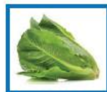
Trueharvest Romaine 983-1010 | 1/18 ct