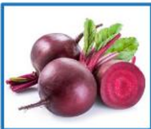
Beets, Red V/F 984-0020 | 5/5 lb