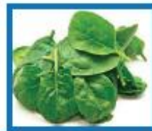
Spinach Clean & Trim 980-3232 | 4/2.5 lb