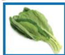
Collard Greens 980-0194 | 1/12 ct