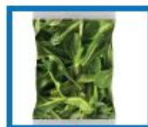
Trueharvest One Cut Romaine 980-6664 | 4/1.5 lb