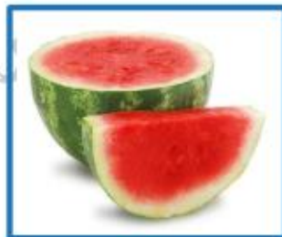
Watermelon Seedless 980-6180 | 1/1 ct