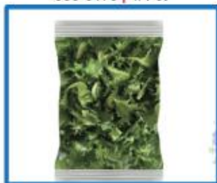
Trueharvest One Cut Crispy Leaf 980-6665 | 4/1.5 lb