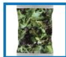
Trueharvest One Cut Truemix 980-6667 | 4/1.5 lb