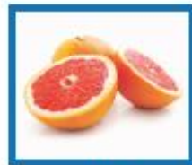
Grapefruit, Ruby 980-4147 | 1/5 lb 980-4097 | 6/5 lb